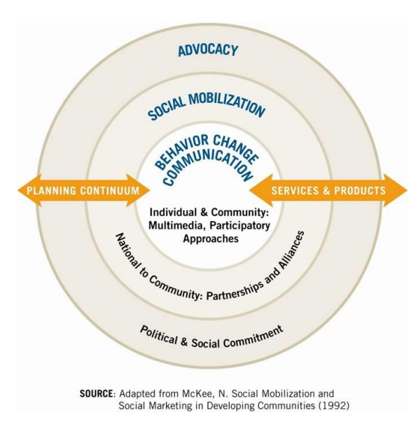
Figure 3: Strategic Approaches in C4D

Advocacy is often most useful on the "outer ring" of the ecological model (Fig. 3) at right, for influencing decision makers, policies and legislation at the "enabling environment" level. Social mobilization can help trigger or inspire community-level action that is essential when problems are of a communal nature, such as discrimination against children with developmental delays and disabilities, and seeking ECD services, where individual decisions to discriminate against children with developmental delays or disabilities, or the decision to keep a child at home during the first five years of life can have negative consequences for neighbours and the larger community, particularly in the long term.