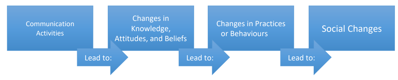
Figure 1: A Theory of Change Approach

The present study provides baseline data for the C4D ECD strategy, which will be implemented between 2019 – 2021 and beyond. Baseline data differs from formative data in that it measures the current state of two sets of development-related indicators: behavioural indicators, which are concerned with practices, or "do" indicators; and affective indicators, which are concerned with people's knowledge, beliefs, and attitudes, including perceptions of social and cultural norms, towards new behaviours or practices. In C4D, changes in the affective dimension are precursors to changes in the behavioural dimension, and are influenced by communication activities, as in Figure 1.